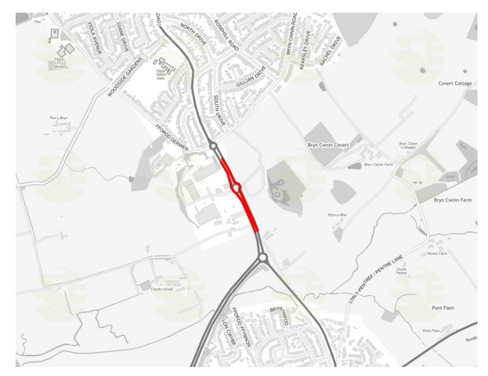
No.6 – A525 Rhuddlan Road, Rhyl – North of Bryn Cwybr Roundabout to south of Toucan Crossing o/s Clwyd Retail Park