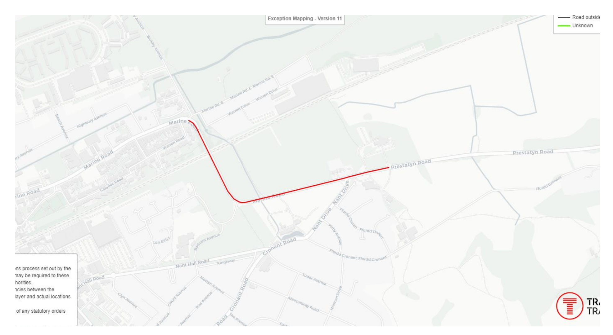
No.1 - A548 Coast Road, Prestatyn – East of Nant Hall Road to Marine Road East