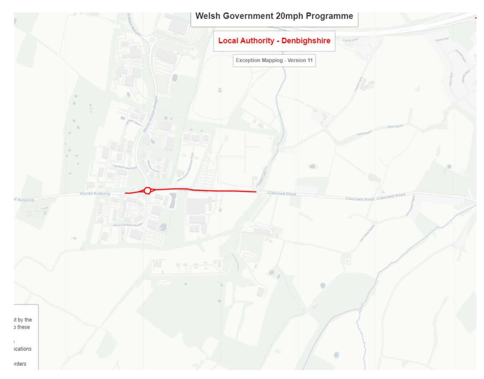
No.2 - B5381 Glascoed Road, St Asaph – Cwttir Lane to west of Ffordd William Morgan